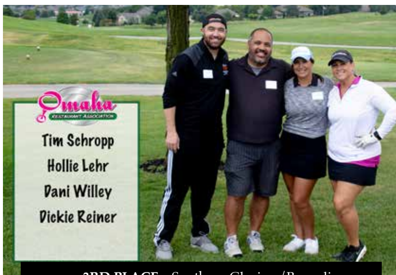
3RD PLACE – Southern Glaziers/Bacardi