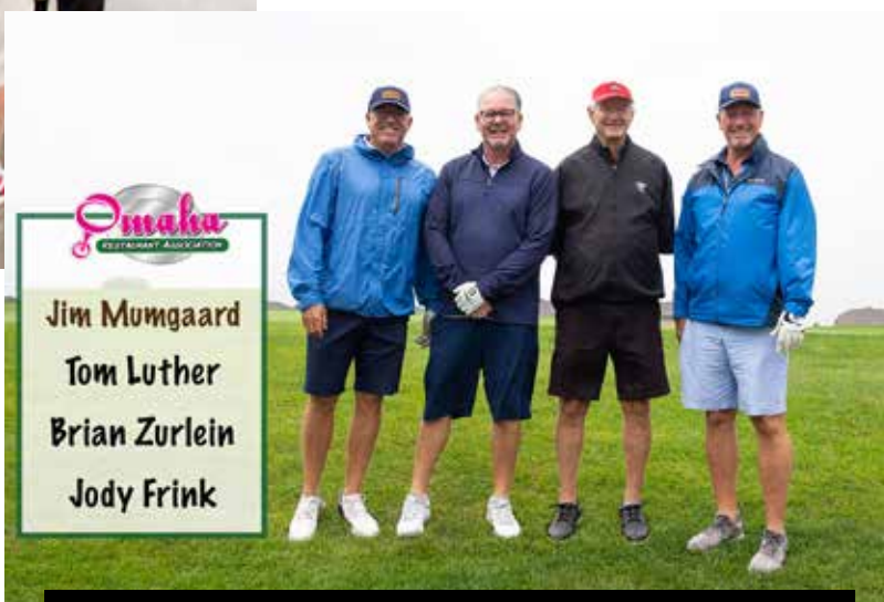
2ND PLACE – WestEnd

We hope you all enjoyed your day of playing, sampling, eating and networking. I know we did!