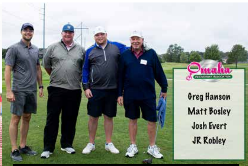
1ST PLACE – Access Payment Processing