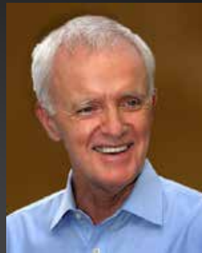
BOB KERREY Grandmothers